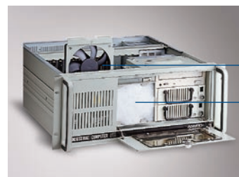
One 85-CFM hot-swap cooling fan