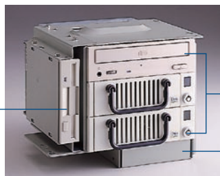
One 3.5" drive bay