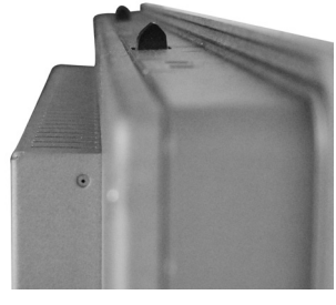
Screw to set up the snap hook out of upper side